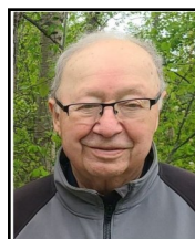
Norm Plato December 1, 2024

WILD RICE Long Grain Organic $12.00 / 1 lb. call: 345-6329