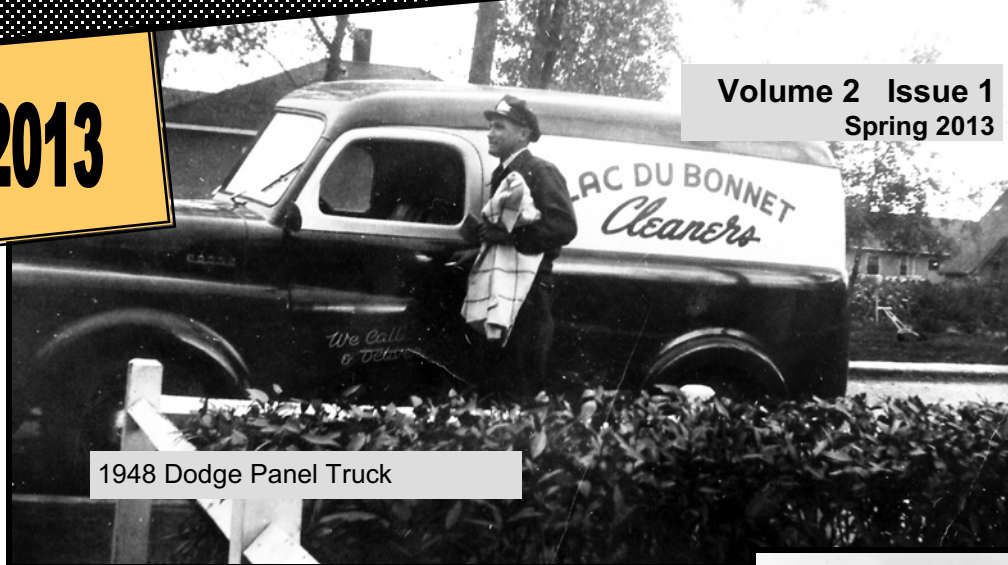
1948 Dodge Panel Truck