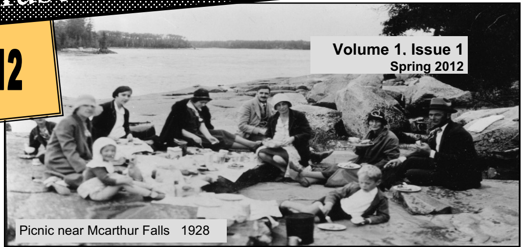
Picnic near McArthur Falls 1928